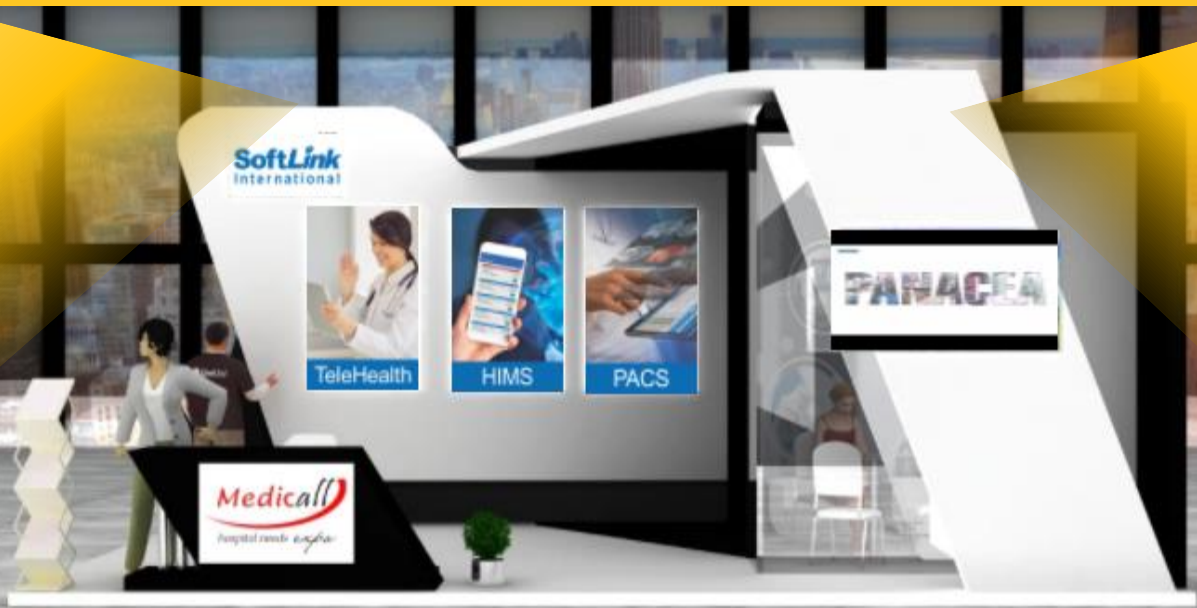
Exhibit from the comfort of your home or office